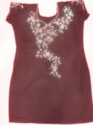
Dark Brown Suit With zardosi work Price ₹ 2499