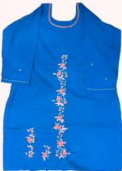
Celtic Blue Suit With Zari Work Price ₹ 3250