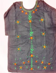
Dim Gray Suit With Zari work Price ₹ 1250