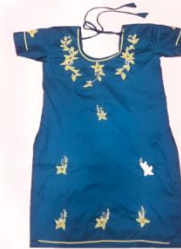
Harlequin Green Suit With Zari Work Price ₹ 2300