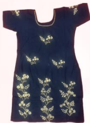
Yankees Blue Suit With Zari Work Price ₹ 1800