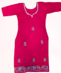
Dark Washed Red Suit With Zari Work Price ₹ 2995