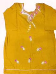
Guo Tie Suit With Zari Work