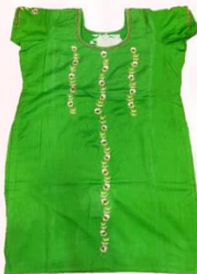
Harlequin Green Suit With Zari Work Price ₹ 2900