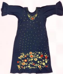
Navi Blue Suit With Zari Work Price ₹ 2890