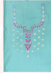
Riptide Suit With Zari Work Price ₹ 2300