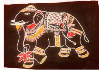
Elegant Hand Crafted Scenery Price ₹ 2500