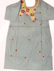
Dark Gray Suit With Zari Work Price ₹ 4000