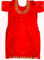
Red Suit With Zari Work Price ₹ 2400