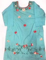
Fuchsia Suit With Zari Work Price ₹ 3899