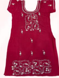
Marron Suit With hand Made Zari work Price ₹ 2350