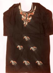
Zinnwaldite Brown Suit With Zari Work Price ₹ 1999