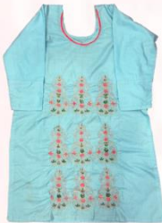
Aqua Island Suit With Zari Work Price ₹ 2149