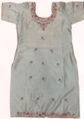
Quick Silver Suit With Zari Work Price ₹ 2800