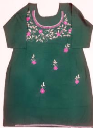
Pantone Suit With Zari Work Price ₹ 1499