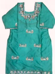
Dark Aqua Suit With Zari Work