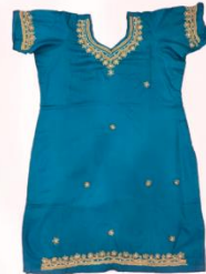
Dark Salmon Suit With Zari Work Price ₹ 3600