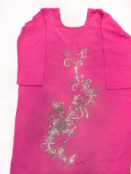
Magenta Suit With Zari Work Price ₹ 1800