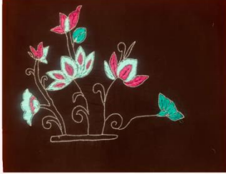
Dark Enfield Brown Suit With Zari Work Price ₹ 2000