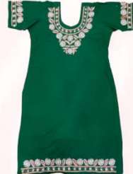
Green Suit With Zari Work Price ₹ 3500