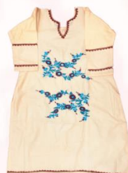
Champagne Suit With Zari Work