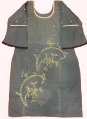
Granite Gray Suit With Zari Work Price ₹ 2800