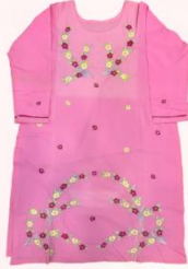
Persian Pink Suit With Zari Work Price ₹ 1400