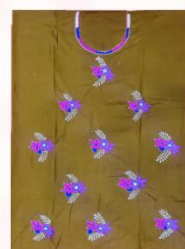
Field Drab Suit With Zari Work Price ₹ 1750