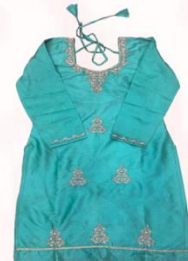
Pelorous Suit With Zari Work Price ₹ 1300