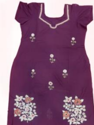
Old Money Suit With Zari Work Price ₹ 1499