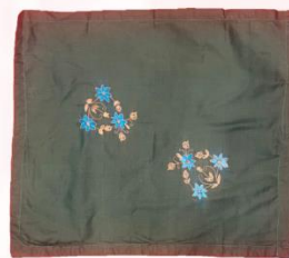
Burnished Pewter With Zari Work