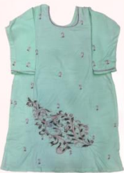
Light Turquoise Aqua Suit With Zari Work Price ₹ 2300