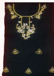
Black Pearl With Zari Work