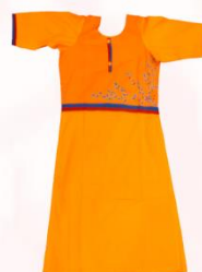
Orange Peel Suit With Zari Work