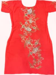
Coral Red Suit With Zari Work Price ₹ 3000