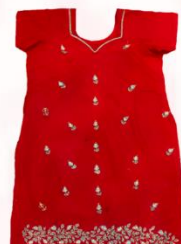
Red Baron Suit With Zari Work Price ₹ 2300