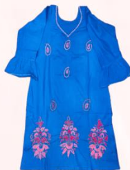
Flamingo Fury Suit With Zari Work