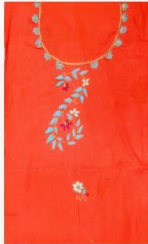
Dark Vivid Red Suit With Zari Work Price ₹ 1200