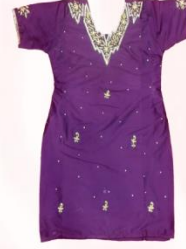
Purple Suit With Zari Work Price ₹ 2300