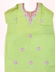
Medium Spring Bud Suit With Zari Work