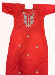
Alizarin Suit With Zari Work