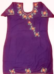
Elegant Purple Suit With Zari Work Price ₹ 1399