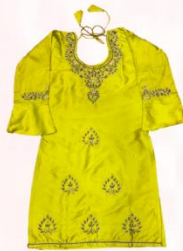
Dark Goldenrod Suit With Zari Work Price ₹ 3600