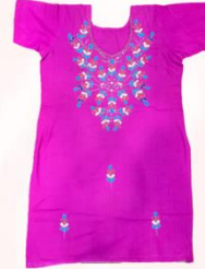
Red Violet Suit With Zari Work Price ₹ 2200