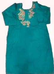
Fuchsia Suit With Zari Work Price ₹ 2400