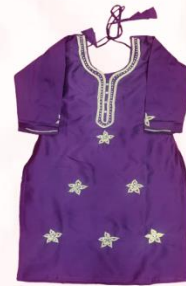
Chinese Purple Suit With Zari Work Price ₹ 3499