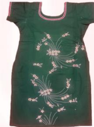
Black Olive Suit With Zari Work Price ₹ 2999