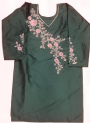
Pine Green Suit With Zari Work Price ₹ 1850