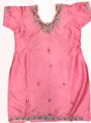
Old Money Suit With Zari Work Price ₹ 2800