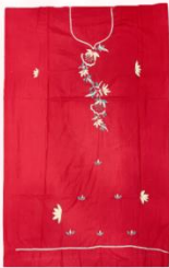
Rosy Brown With Zari Work Price ₹ 2999