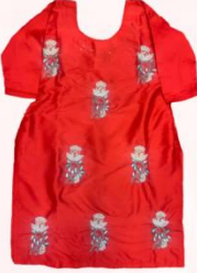
Malachite Red Suit With Zari Work Price ₹ 1900