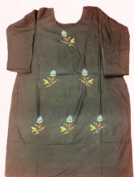
Olive Drab Camouflage Suit With Zari Work