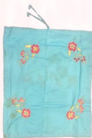
Light Aqua Fiesta Suit With Zari Work