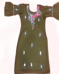
Coral Red Suit With Zari Work Price ₹ 2000