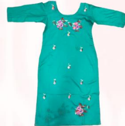
Light Sea Green Suit With Zari Work Price ₹ 2700