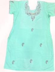
Aphrodite Aqua Suit With Zari Work Price ₹ 2200