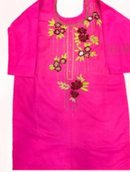
Persian Rose Suit With Zari Work Price ₹ 2200